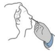
Get a PCR test and isolate

If your child develops any of these symptoms, then arrangements should be made for them to take a PCR test as soon as possible. Your child should remain at home while awaiting the PCR test result. Please note that we are also sending students home if we believe they have one or more symptoms requiring a PCR test.