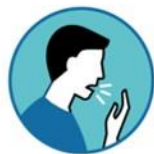
New Persistent Cough